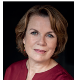
Bernarda Fink Voice