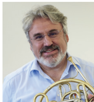
Radovan Vlatković Horn