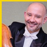
VILMOS OLÁH Hungary violin