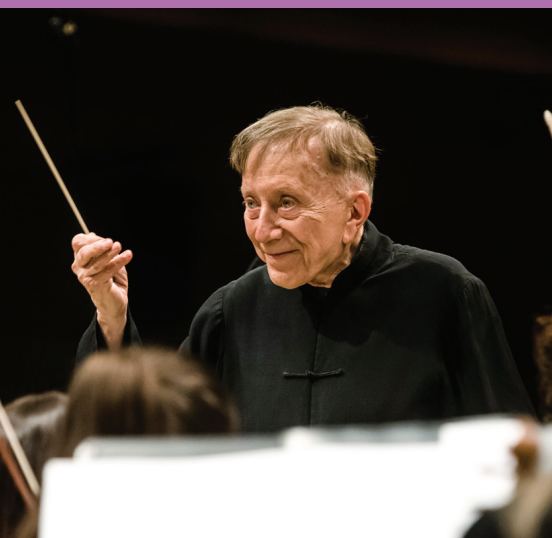
TAMÁS VÁSÁRY conductor