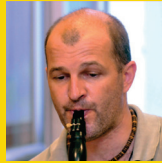
ZSOLT SZATMÁRI Hungary clarinet