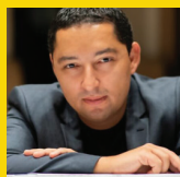
JÓZSEF BALOG Hungary piano