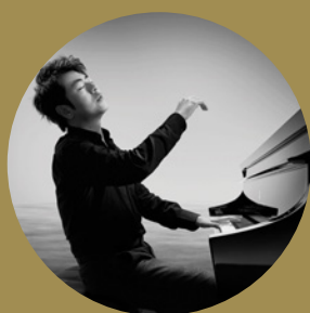
CIPC Honorary Ambassador Lang Lang

SEEKING THE FUTURE LEADERS OF THE PIANO WORLD!