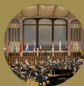
Final Round with The Cleveland Orchestra