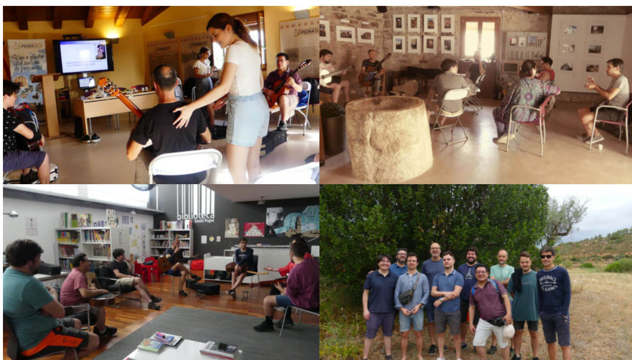
Images of Campus Emili Pujol 2019